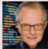
LARRY KING LIVE