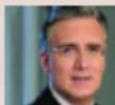
COUNTDOWN W/KEITH OLBERMANN