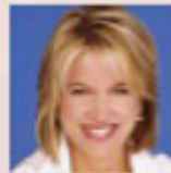
PAULA ZAHN NOW