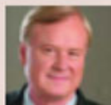
HARDBALL W/CHRIS MATTHEWS