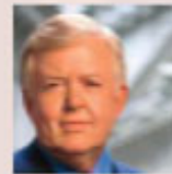
LOU DOBBS TONIGHT