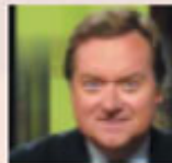
THE TOM RUSSERT SHOW