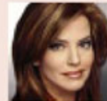
ROBIN & COMPANY