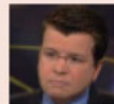
YOUR WORLD W/NEIL CAVUTO