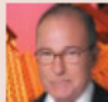
KUDLOW & COMPANY