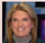
ON THE RECORD W/GRETA VAN SUSTEREN