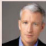
ANDERSON COOPER 360