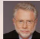
THE SITUATION ROOM W/WOLF BLITZER