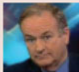
THE O'REILLY FACTOR