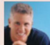
THE BIG IDEA W/DANNY DEUTSCH