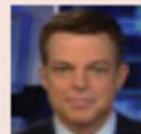
FOX NEWS W/SHEPARD SMITH