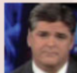
HANNITY & COLMES